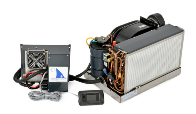
The 12 V version allows small boats to be air-conditioned thanks to the very low consumption and the ECO function.